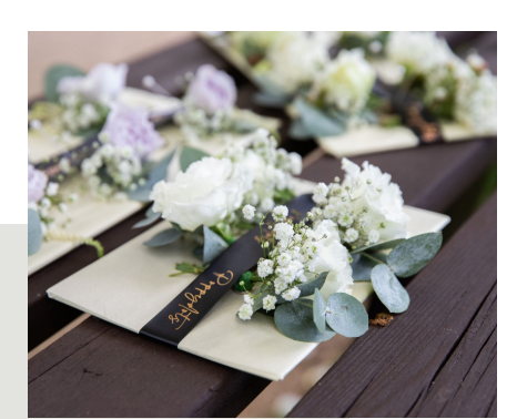
SE Photography Essex