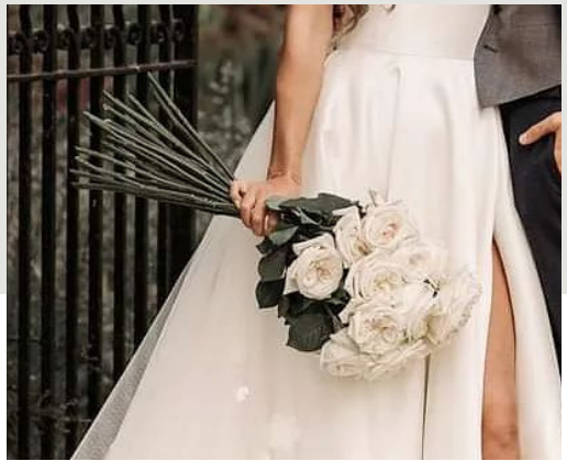
Charlotte Griffiths Photography

There is nothing more special than the bouquet of flowers you carry down the aisle. Exquisite detailing and the best luxury flowers from around the world, displayed in an array of shapes and sizes to suit your theme and décor. You could opt for a circular shape, or maybe a teardrop/shower bouquet is more your style. We have found that our Signature Oblong has been a popular favourite in 2022!