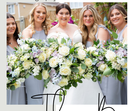
SE Photography Essex

There is nothing better than spending the morning of your day with your bride tribe. Whether you're getting ready together at your wedding venue, or from home, you will undoubtedly be extremely excited about what the day has in store.